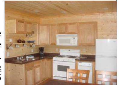
Cabin 4 new look. The cabin was gutted last January by a fire. We put it back into service on Memorial Day Weekend.

sign maker with Dale helping to install the lovely log frame work. We added small seating couches to both Cabin 5 and Cabin 6 and we replaced several worn out appliances. We added insulation to all of our cabin roofs.