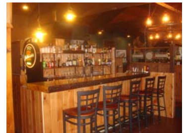
Cascade Restaurant/pub is located just 5 minutes from Solbakken. Try your discount at our new pub with daily happy hour and music on weekends!

older windows and we are turning the heat down whenever a cabin or room goes unoccupied. Whenever we replace an appliance we choose energy star rated appliances.