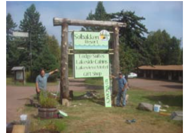
Above: New sign in the final stages of construction. Note, it is now beautifully finished and lit at night!

It looks really nice and will make us much easier to find. We are still waiting for some badly needed snow and hoping that our Christmas-New Years time will be filled with Cross Country skiing, snowshoeing and enjoying the beauty of a perfectly white landscape. Winter is a very unique time on the North Shore with the lake generally remaining open all winter long. Make your plans soon to come up for a visit!