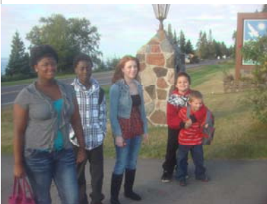
Top: First Day of School